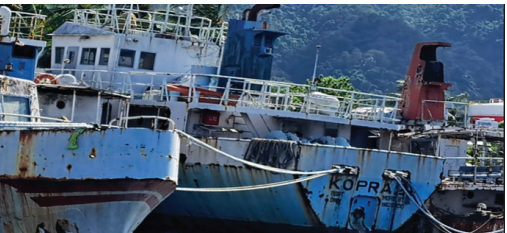
Wreck Name : KOPRA 2 Location : RABAUL SHIPPING WHARF