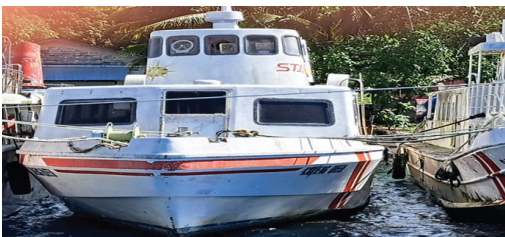
Wreck Name : KAVIENG QUEEN Location : RABAUL SHIPPING WHARF