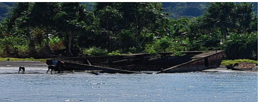
Wreck Name : UNKNOWN Location : ISLAND SHIPPING WHARF