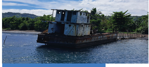
Wreck Name : MV SANKAMAP Location : YACHT CLUB BEACH FRONT