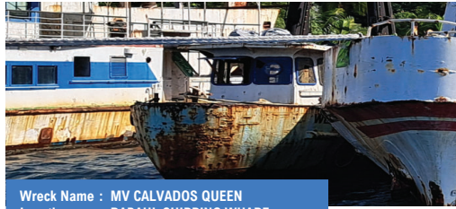
Wreck Name : MV CALVADOS QUEEN Location : RABAUL SHIPPING WHARF