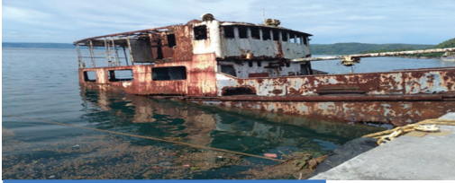
Wreck Name : MV MAKAYA Location : TOBOI SHIPYARD, BISMARK JETTY