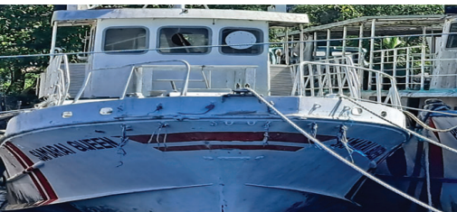
Wreck Name : SAMARAI QUEEN Location : RABAUL SHIPPING WHARF