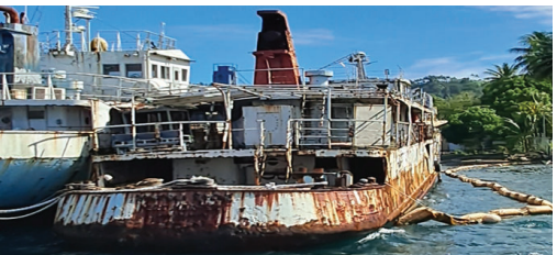
Wreck Name : MOROBE QUEEN Location : RABAUL SHIPPING WHARF