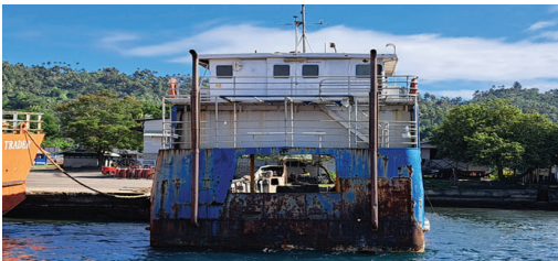
Wreck Name : MAJOR DUNDEE Location : KUYE WHARF