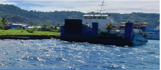
Wreck Name : MV ELLIE TANYA Location : WRECK WHARF