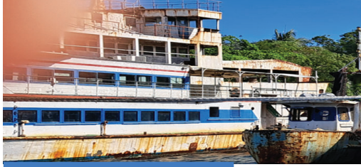
Wreck Name : MV KONDOR Location : RABAUL SHIPPING WHARF