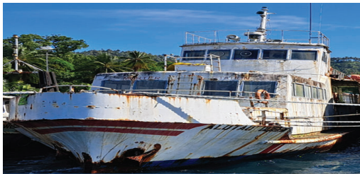
Wreck Name : ALOTAU QUEEN Location : RABAUL SHIPPING WHARF