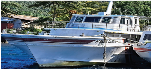
Wreck Name : ALOTAU QUEEN Location : RABAUL SHIPPING WHARF