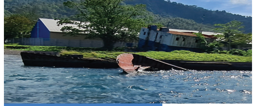
Wreck Name : UNKNOWN Location : WRECK WHARF