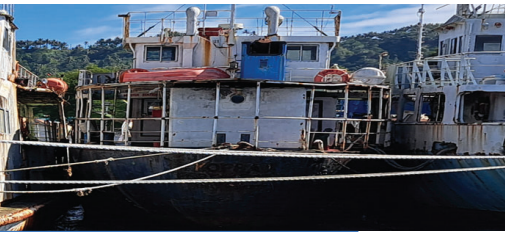
Wreck Name : KOPRA 1 Location : RABAUL SHIPPING WHARF