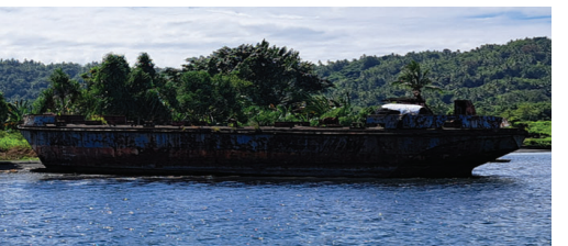
Wreck Name : MV LAE EXPRESS Location : ISLAND SHIPPING WHARF