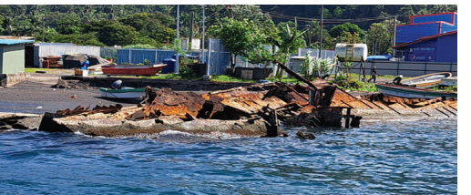
Wreck Name : KIMBE EXPRESS Location : COASTAL SHIPPING WHARF