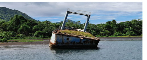
Wreck Name : MV SUNMIL Location : YACHT CLUB BEACH FRONT