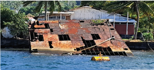
Wreck Name : UNKNOWN PONTOON Location : RABAUL SHIPPING WHARF