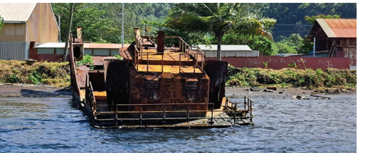
Wreck Name : MARUNGA Location : WRECK WHARF