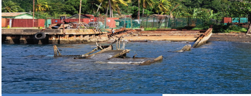
Wreck Name : MV BANDA Location : NORTH END CPL WHARF